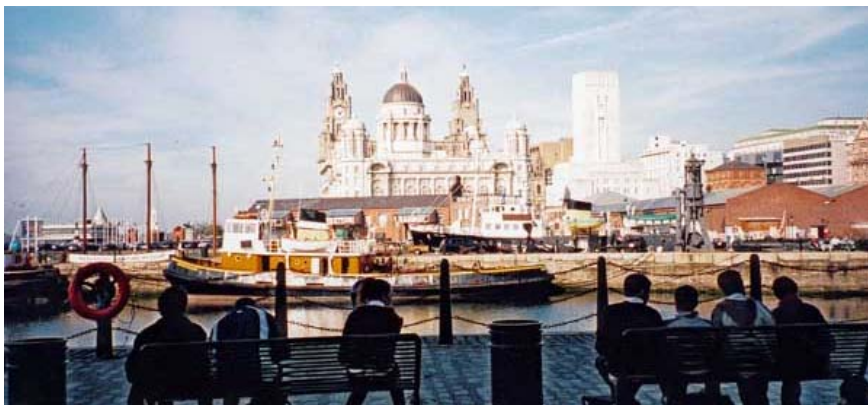
Alun School art pupils sketching in Liverpool, European Capital of Culture for 2008

Alun School — Wrexham Road Mold — Flintshire — CH7 1EP Tel : 01352 750755