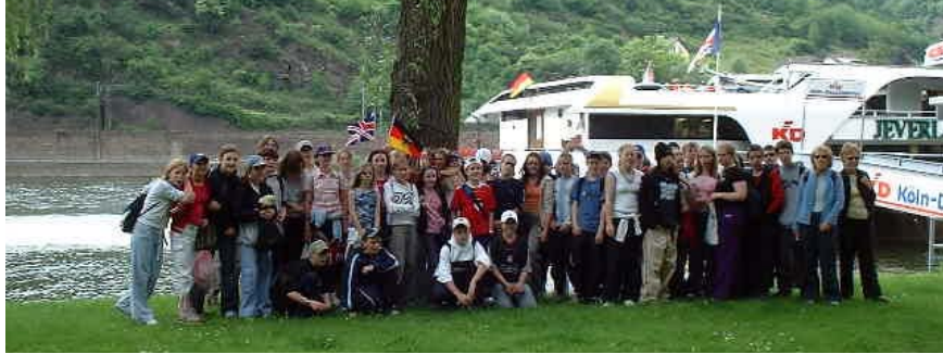
Over half-term, fifty-one pupils from Year 8 and six staff (pictured above) visited Germany. Full story on page 6.